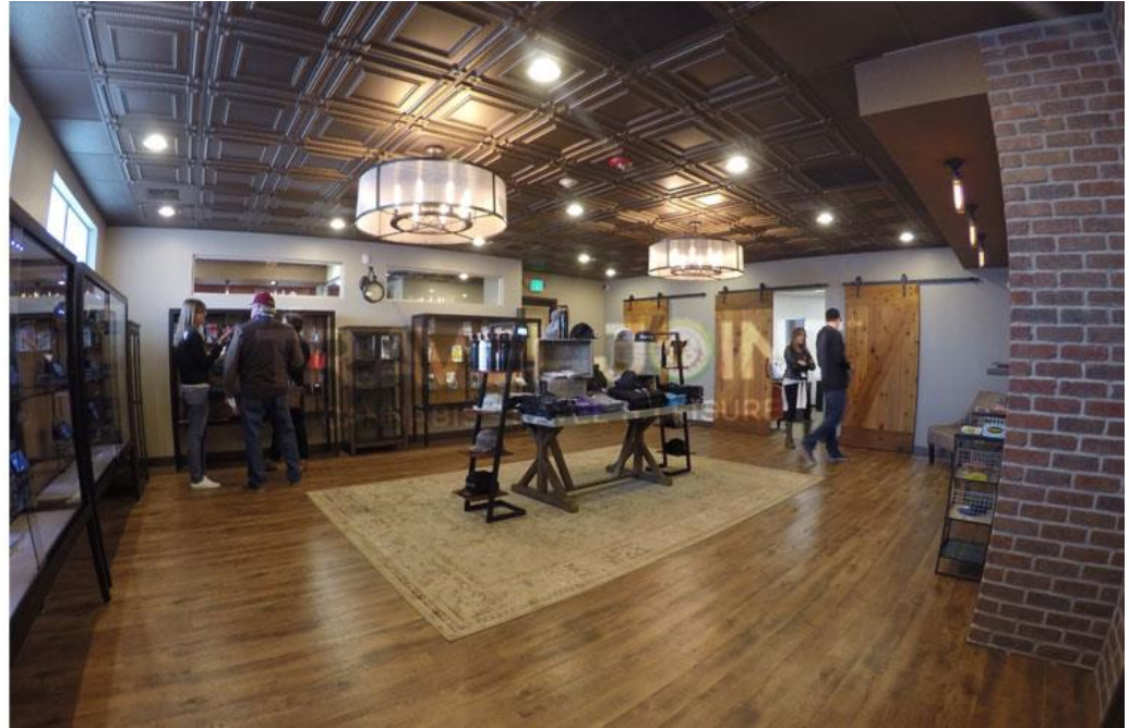
Dispensary of a 4Front Client