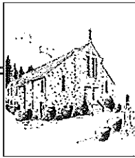
St. Linus Parish