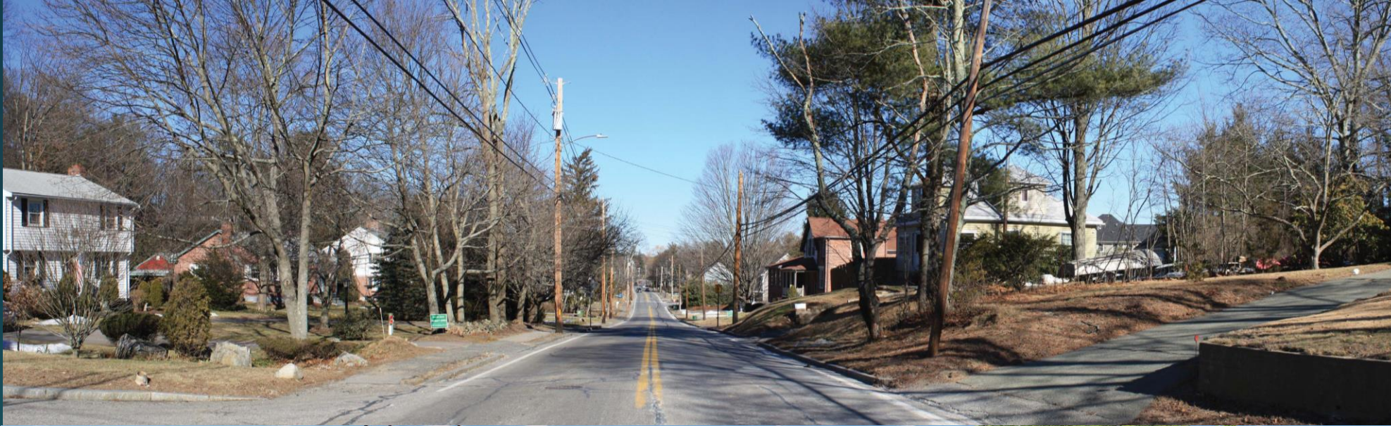
Existing - Facing North at Bear Hill Road