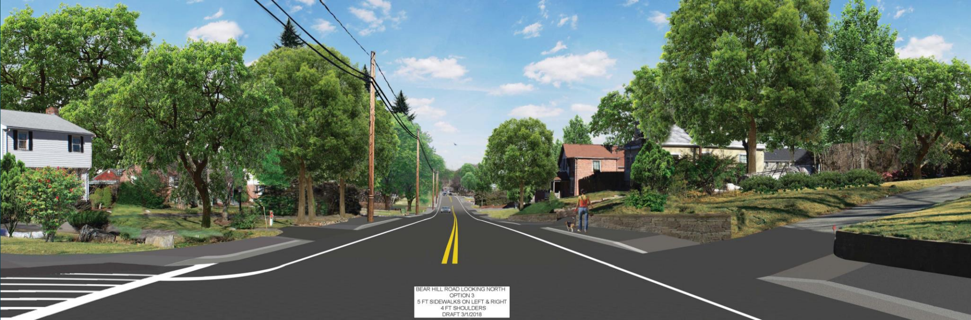
Proposed - Facing North at Bear Hill Road

BEAR HILL ROAD LOOKING NORTH OPTION 3 5 FT SIDEWALKS ON LEFT & RIGHT 4 FT SHOULDERS DRAFT 3/1/2018