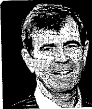
William Francis Galvin Secretary of the Commonwealth of Massachusetts