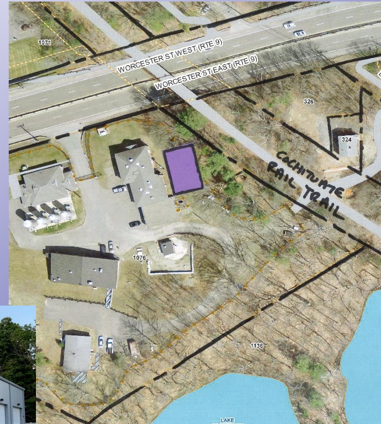
Schematic Site Plan