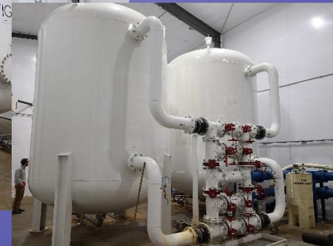
Hudson MA, PFAS Removal Facility