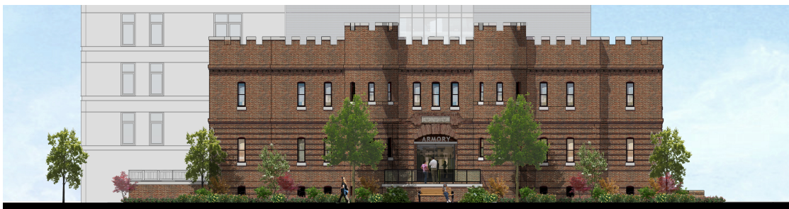
Image: West Newton Armory, Newton

Passive House is the gold-standard for sustainable building practices and we plan to have the first certified multifamily project in Natick.