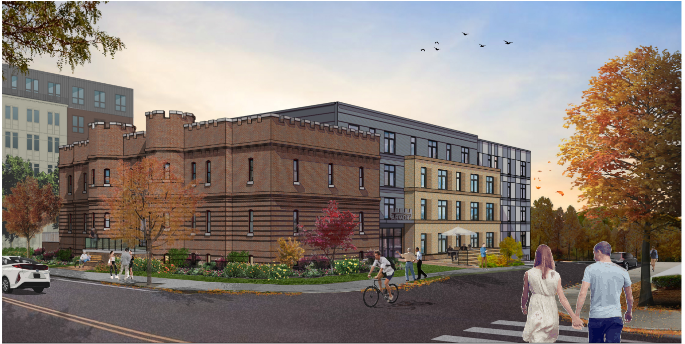
Image: West Newton Armory, Newton