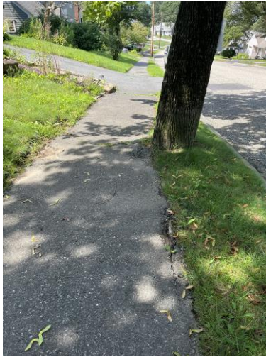
15 University Dr Heaving sidewalk