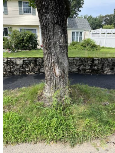
6 Beverly Rd Requested By Abutter