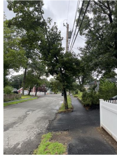
7 Melvin Rd Requested By Abutter