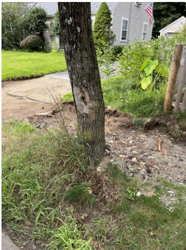
4 Longfellow Rd Requested By Abutter