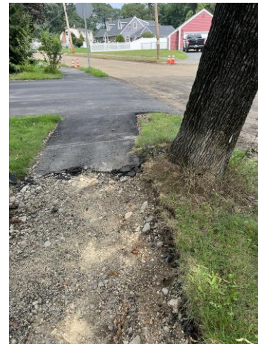
4 Longfellow Rd Requested By Abutter