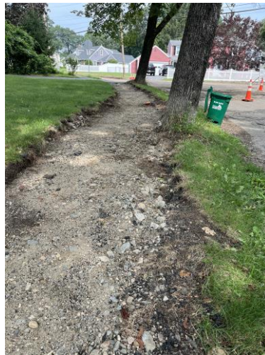
4 Longfellow Rd Requested By Abutter